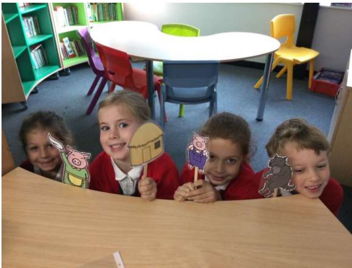
This week Class 1 have been preparing for retelling the story The Three Little Pigs. We have sequenced images, composed captions verbally and used props for our role play which we especially enjoyed.

In Year 6 this week, we did an enquiry that revolved around Henry VIII's divorce and break with Rome. Children became advisors to King Henry and tried to understand the competing pressure that forced Henry to divorce Catherine and marry Anne.